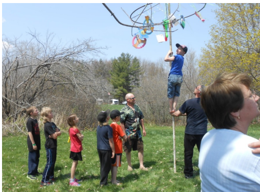
Climbing the Maibaum in 2015